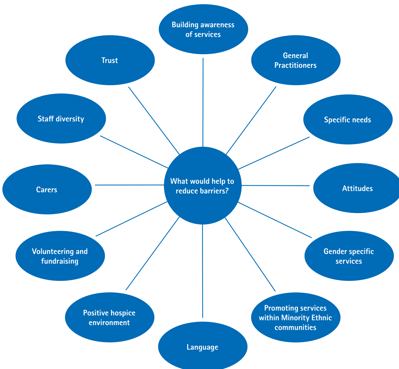
Diagram 2: Participants' views on how to reduce barriers to services

The groups talked about the need to build awareness – predominantly through word of mouth – of the types of services Marie Curie provides, the conditions that are supported and how to access the services. They also suggested ways to promote the services in their communities and stressed that people from Black, Asian and Minority Ethnic backgrounds were keen to help fundraise and volunteer for the charity and not just be seen as service users. Diagram 2 summarises participants' suggestions.