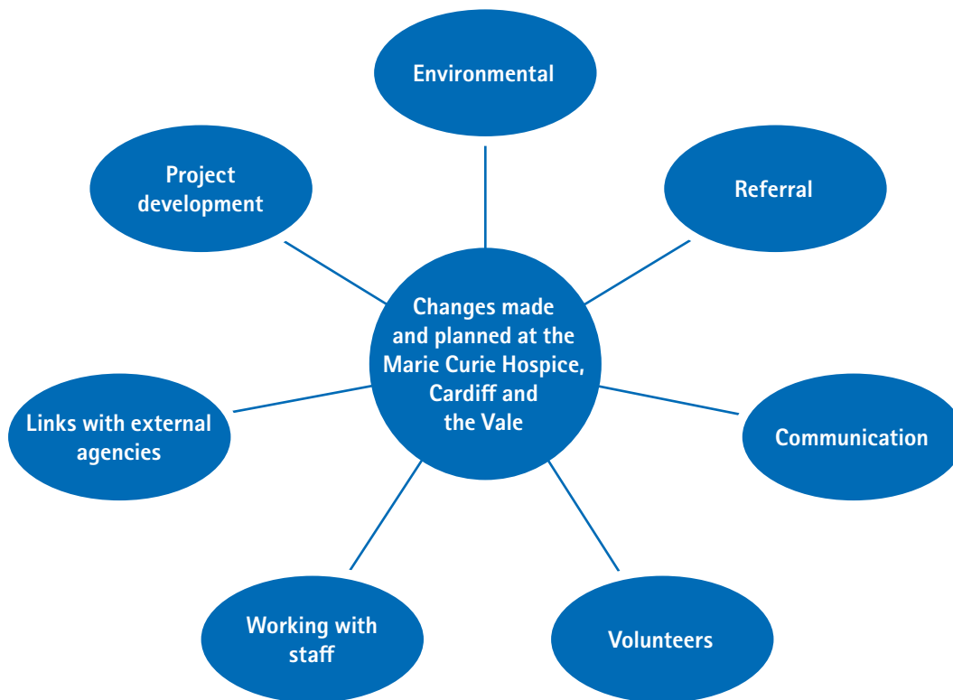
Diagram 3: Changes made and planned at the Marie Curie Hospice, Cardiff and the Vale.

We will continue to seek advice on ways to remove barriers to access and improve services for patients, carers and families from Black, Asian and Minority Ethnic backgrounds in South East Cardiff.